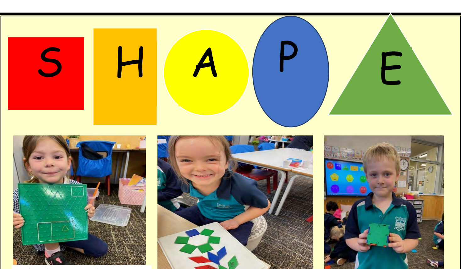
The door on my house is a rectangle - Holly