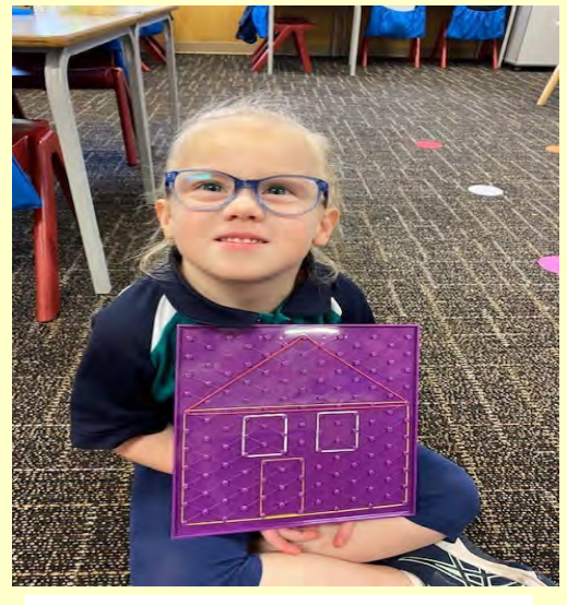
My house has a triangle shaped roof - Ruby